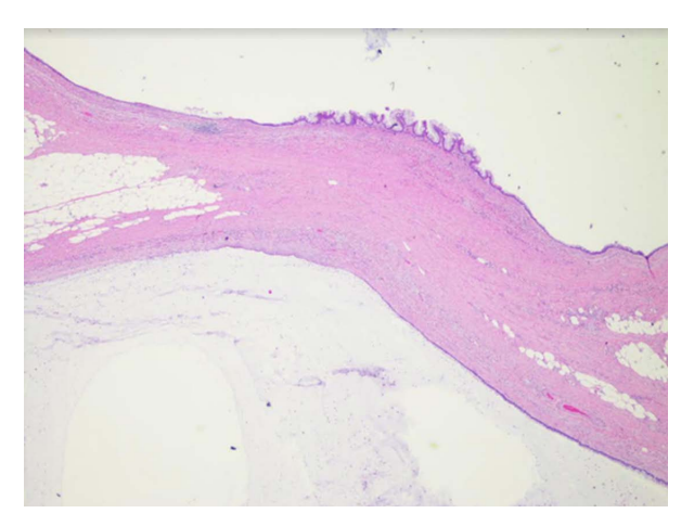
Figure 2. Low-grade appendiceal mucinous neoplasm at the distal tip of the appendix. H & E.